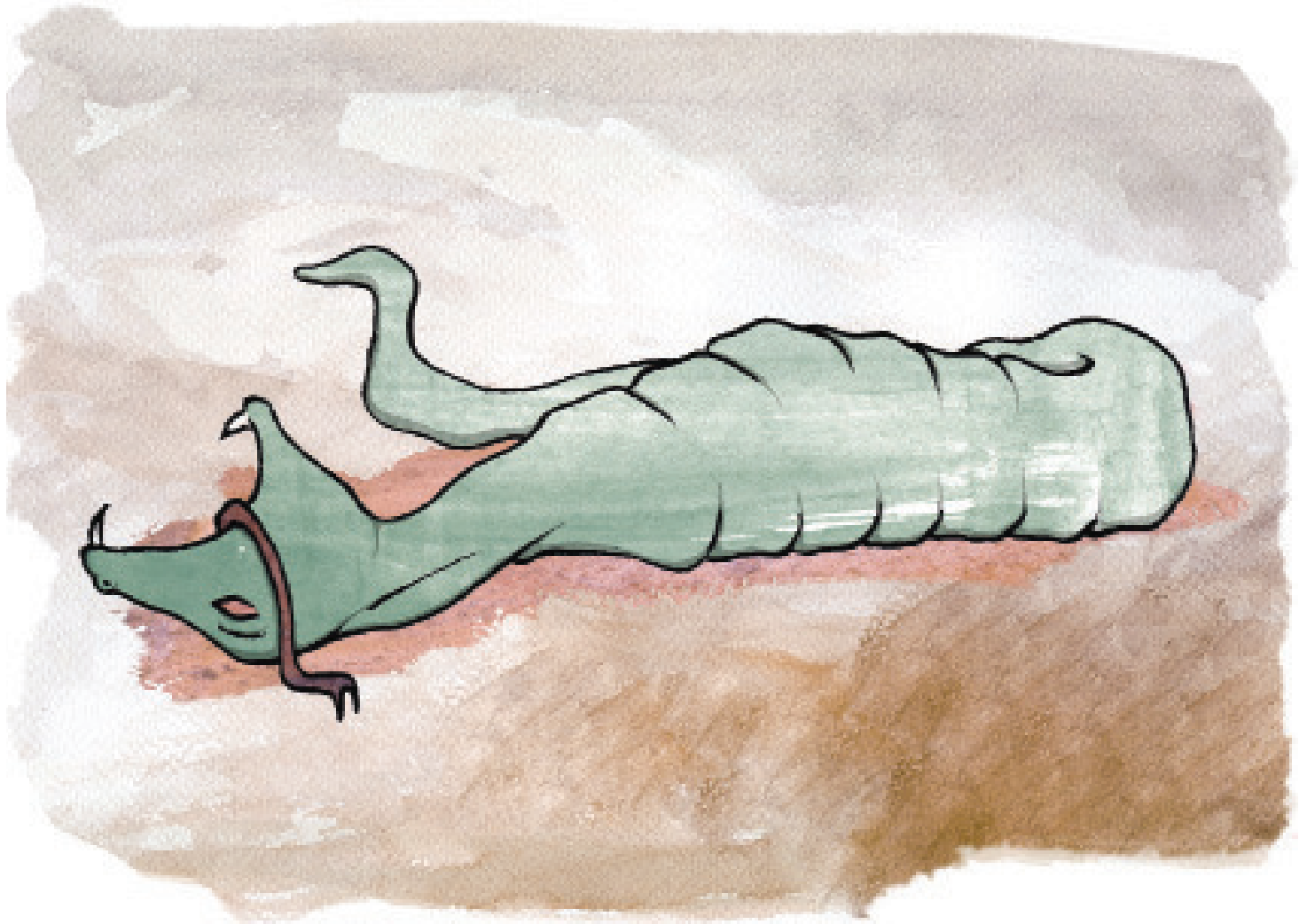
The Snake Emperor, once an awesome sight, was now bedraggled and limp.